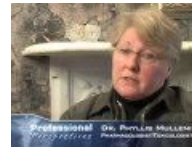
Professional Perspectives on Water Fluoridation

(https://fluoridealert.org/fan-tv/cripping-waters/)