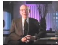
Don't Swallow Your Toothpaste

(https://fluoridealert.org/fan-tv/prof-perspectives/)